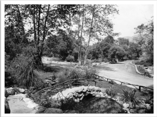
Fernbrook Street near Nioradara circa 1920s