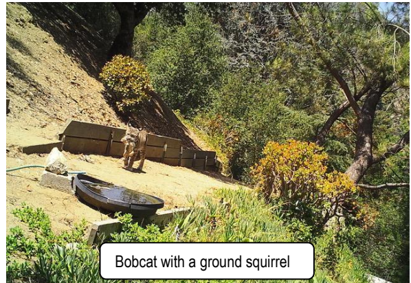
Bobcat with a ground squirrel