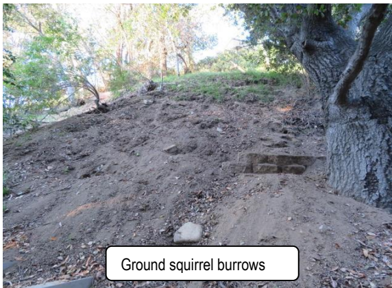
Ground squirrel burrows