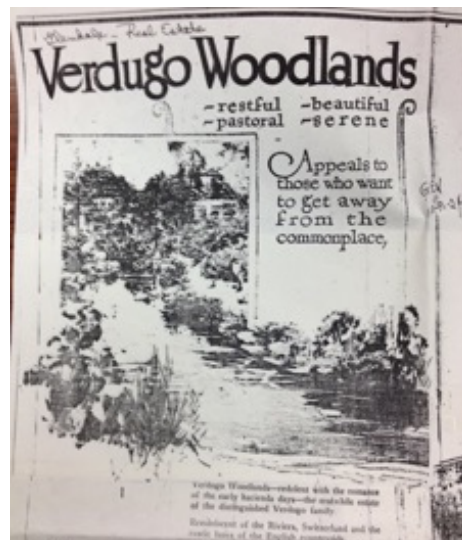
1924: An ad for Verdugo Woodlands, Glendale Evening News , October 31, 1924.