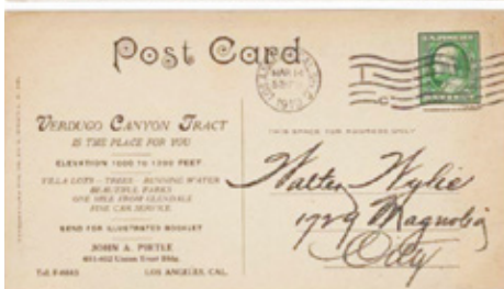
1910: A postcard advertising the Verdugo Canyon Tract.