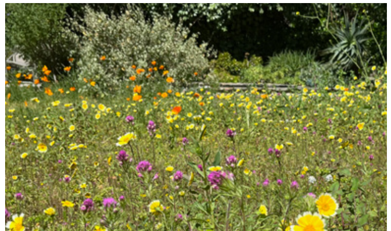
Wildflower meadow where once was lawn in a backyard on Niodrara.