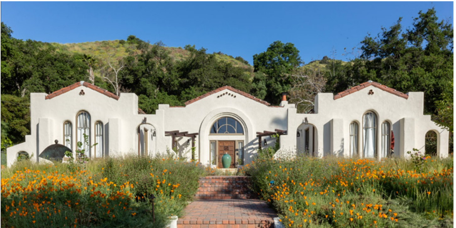
Another Woodlander’s front yard recently landscaped with water-saving native plants. Photo by VVWNA member Jack Foote .

The drought is not over, and we hope that more Woodlanders will go native!