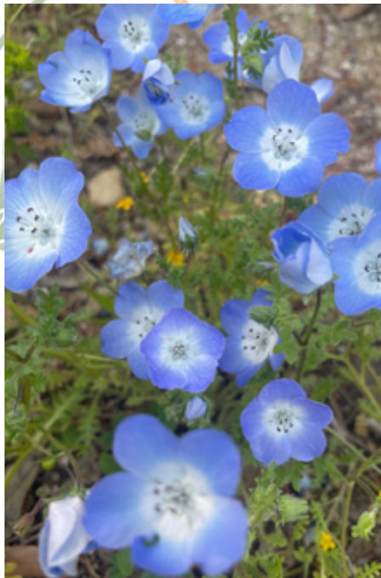
Baby blue eyes are perfect for planting in the parkway between sidewalk and street.