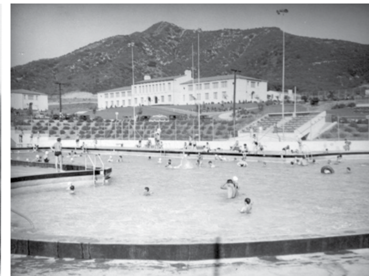
Circa 1938.